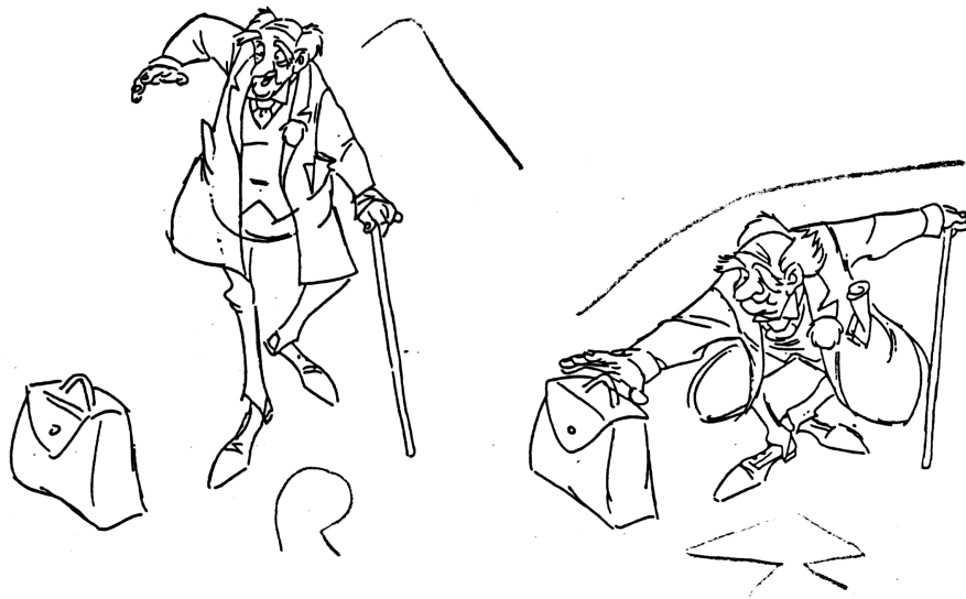
A Milt Kahl example of anticipation (preparation) and stretch.

There once was an artist who sketched So a career in the arts he thus fetched He studied in class But oh my, and alas When his drawings weren't good he was wretched.